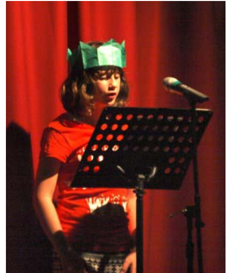
(No photo of Sam - sorry)