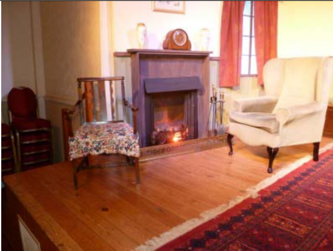
A blazing log fire