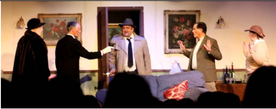
Inspector Pratt takes the gun from Bunting – exit murderers!