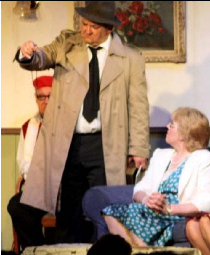
The hollow book holds the key?