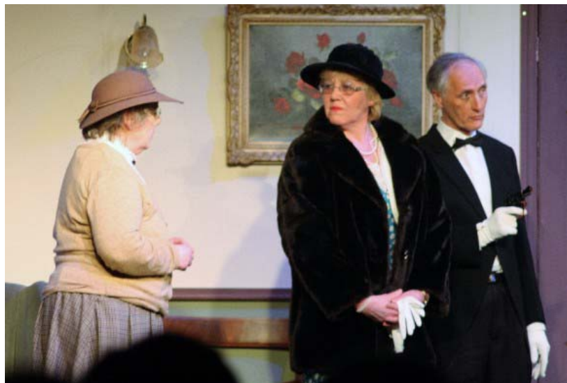
Margaret boasts about the murders. Bunting is unmasked as Benson (the Mess orderly) and Margaret's former lover.