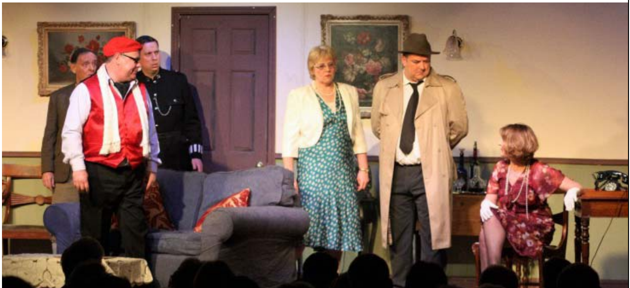
Accusations fly around.