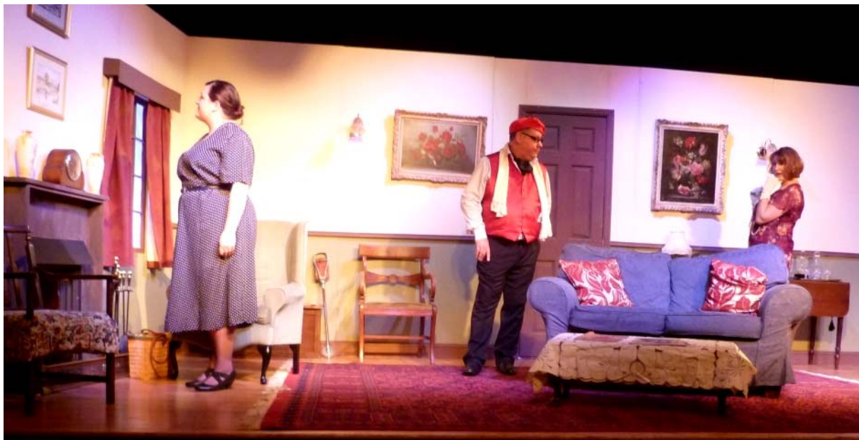
Elizabeth urges Pierre to murder Dorothy.