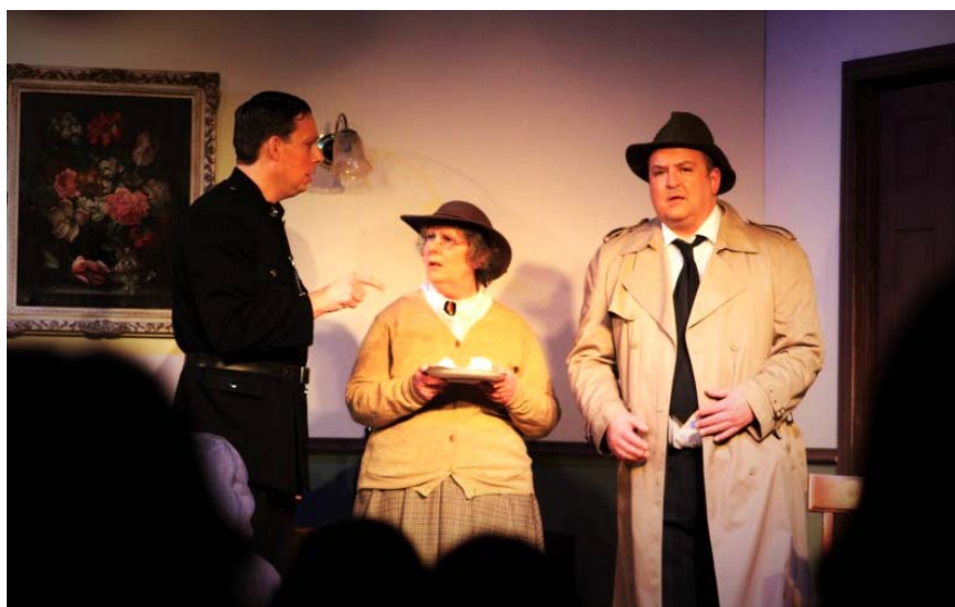
Teacakes – but not for Thompkins!