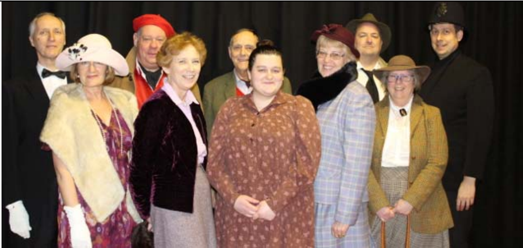
Cast picture from the programme