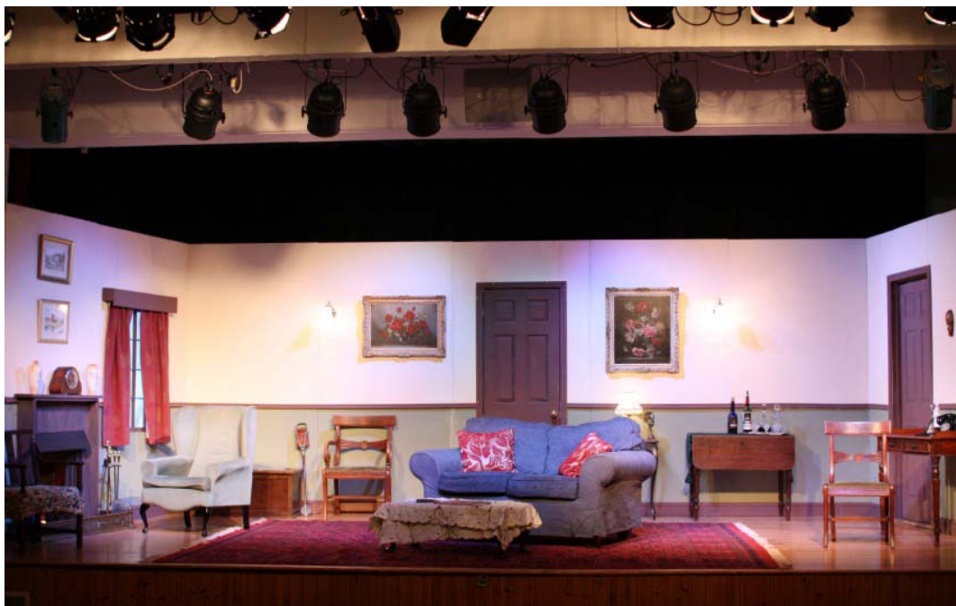
Set lit for a late afternoon