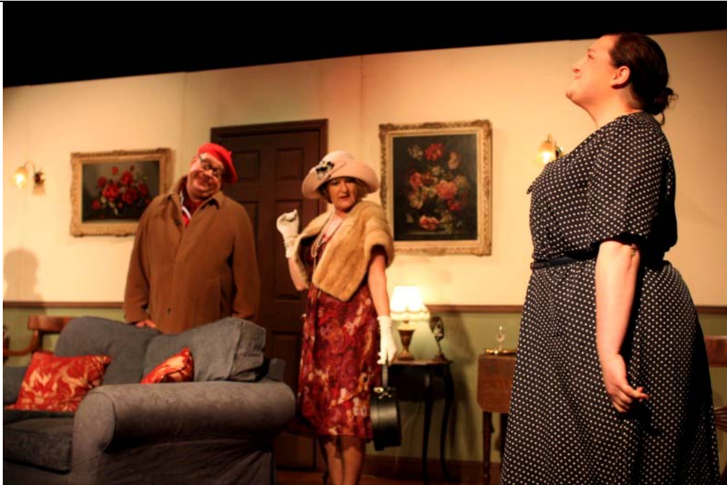
Some 'catty' comments about Dorothy's dress!