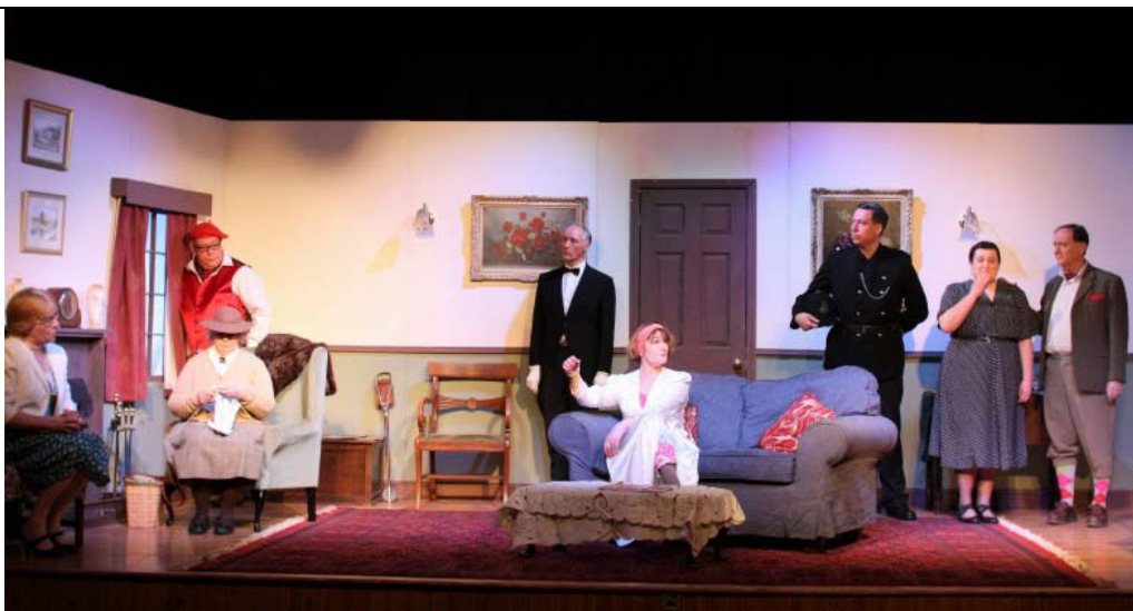
All gathered awaiting the Inspector.