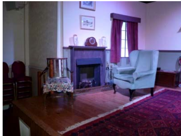
‘Atmospheric set’ prior to performance