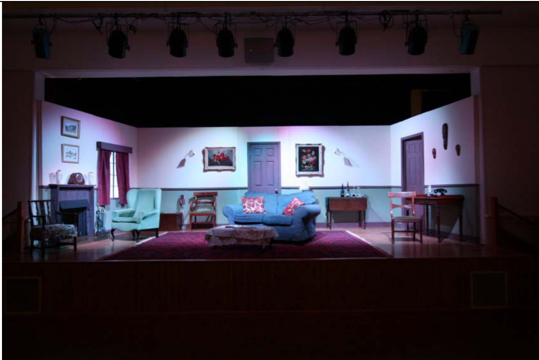
The set – the lounge of a country manor house in the 1930s – the Golden Age of the 'Detective Story'