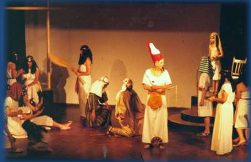
'FROM PHARAOH TO FREEDOM 1987