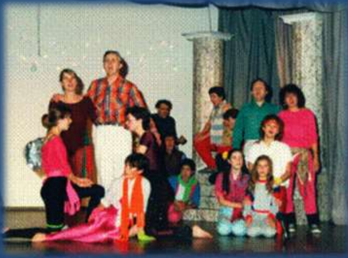
'ROCK NATIVITY' 1984