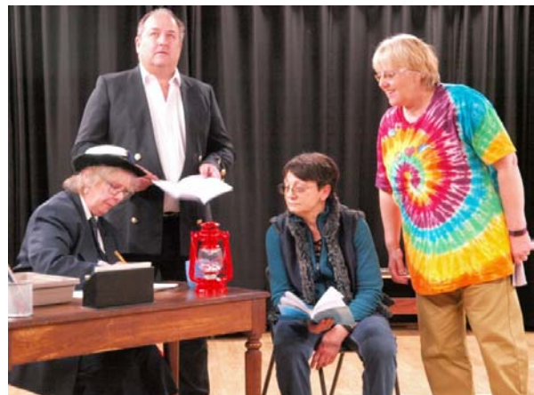
Escape is being planned!