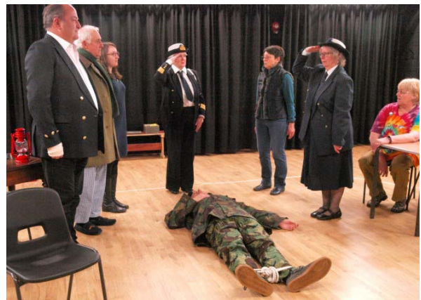
The Commodore arrives!