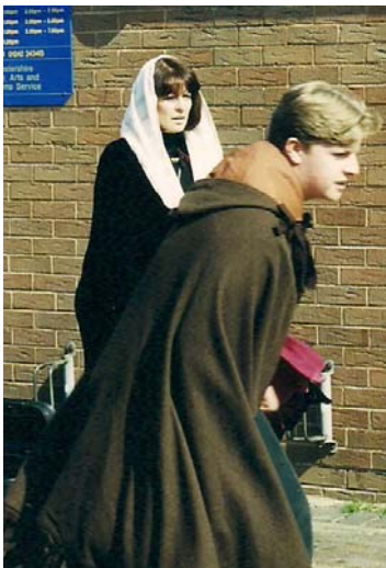
Barabbas shouts 'Death to the Romans'