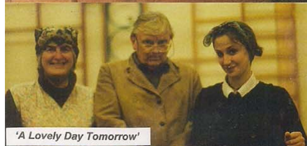
'A Lovely Day Tomorrow'