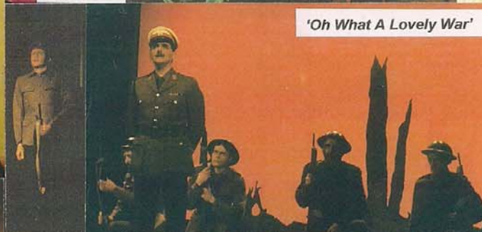
'Oh What A Lovely War'