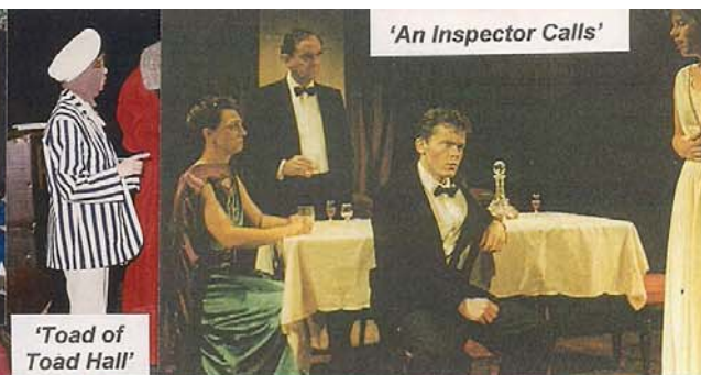
'An Inspector Calls'