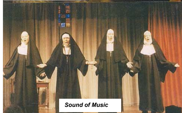
Sound of Music