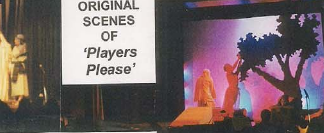
ORIGINAL SCENES OF 'Players Please'