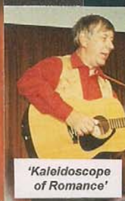
'Kaleidoscope of Romance'