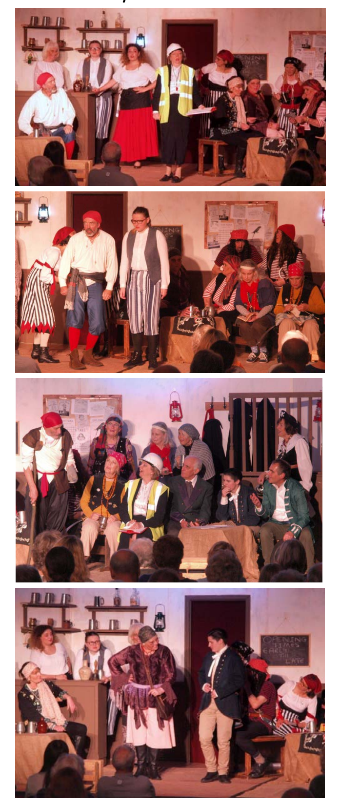
Tip: Copy links given into your browser