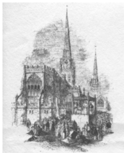
Engraving of 'A Pageant in Coventry' , by St Michael's Church with the spire of Holy Trinity Church in the background.